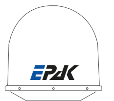
DSi13 Ku PRO