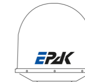
DSi9 Ku PRO